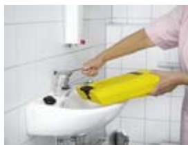
Fresh and dirty water tanks (4 litres each) are easy to remove, refill and clean

Easy access close to edges as well as under furniture and low objects due to low cleaning head: Only 7 cm!