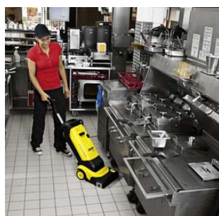
As easy to operate as a vacuum cleaner