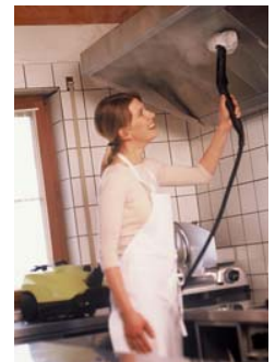
2.7-metre steam hose permits overhead operation without having to lift the unit