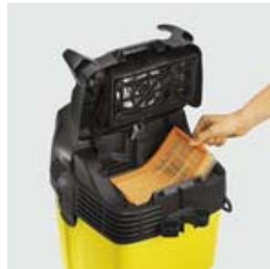
Main feature of the compact and powerful NT 35/1 is the unique and very effective system for fully automated filter cleaning - TACT.