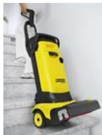
Easy to transport