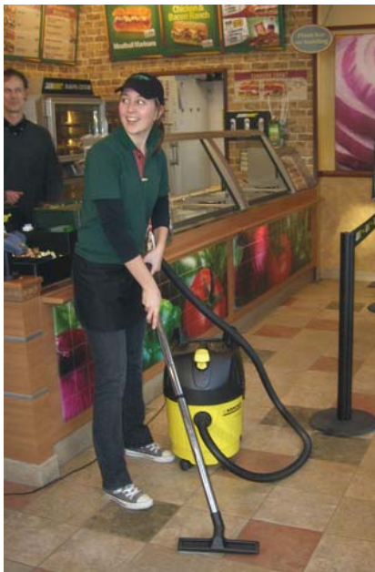
This wet/dry vacuum cleaner is fully equipped with accessory - and therefore ready-to-use.

The NT 35/1 is a handy and strong wet/dry vacuum cleaner for commercial applications. It is equipped with the innovative and patented TACT-System for fully automated filter cleaning. The NT 35/1 provides full accessory that can easily be retained in the integrated accessory storage.