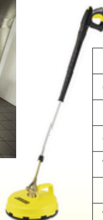
FR 30: Max. 180 bar / 850 l/h / 60 °C.